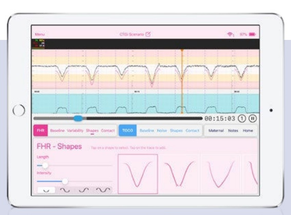
Fetal Heart Rate